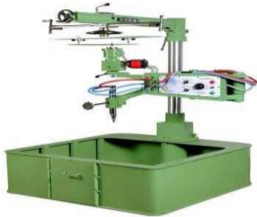
PROFILE GAS CUTTER