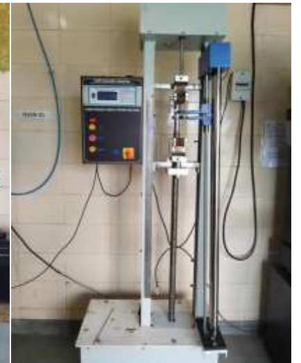
DIGITAL RUBBER UTM