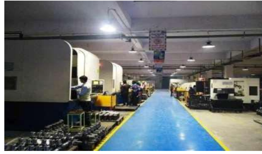
CNC & MACHINES LAYOUT